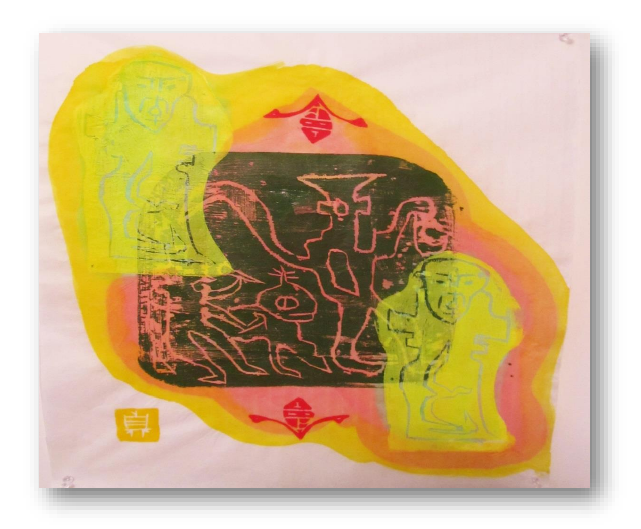
Heart's Journey 18 x 22 in.

The icons of the Ancestral Guardians set off a zone of shamanic transformation that contains and inspires the ongoing music of the heart's journey.