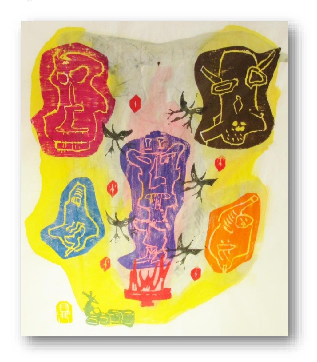
The Five Corpse Demons 24 x 26 in.

Hidden Animal Powers drum up the inner fire that reveals the demons of the Five Elements, Metal , Fire , Earth , Water and Wood . The scavenging birds strip away the old to release the hidden sparks of intelligence.