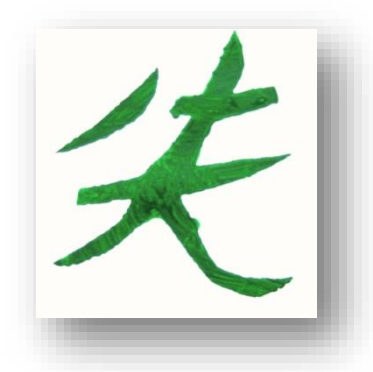
Shi, let go , means lose, miss, let go of, let escape, disappear; neglect, break a promise, fail, get lost; mistake, mishap, defect. It is literally an image of letting something fall from the opened hand and is a synonym of yi , go and come freely, give license to, follow your wishes.

this ritual gesture to rang , rites of expulsion and exorcism and rang , rites of propitiation that, together, bring rang abundance, prosperity and happiness for all. In Change this magical gesture manifests as the word shi , with the radical da or Great: